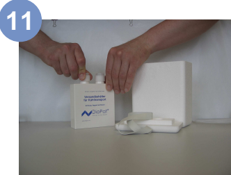
Ensure to screw on cap on cooling Element tightly