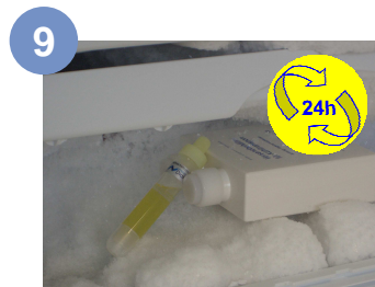
Store urine sample and cooling Element for a minimum of 24 hours in a ***freezer compartment (-18°C) until shipment