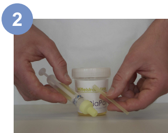
Have urine monovette and canula ready