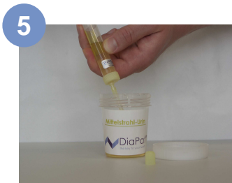
Soak up urine into monovette, make sure to pull out piston completely