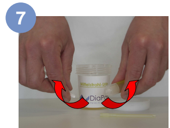
Break piston at predetermined breaking point