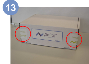
Insert sample and documents into packet and seal it with the badges