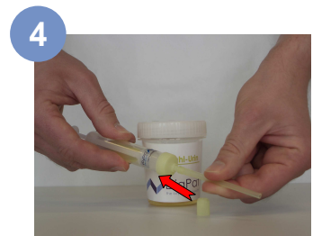
Place canula on urine monovette