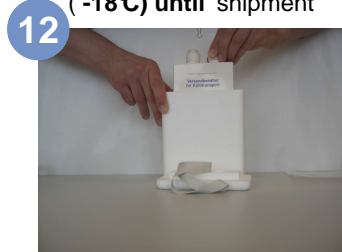
Insert cooling element into styrofoam box and save cover with elastic band