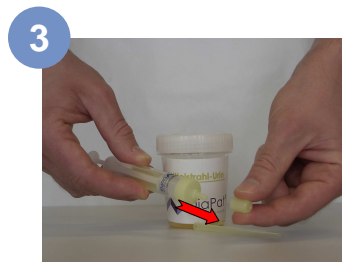
Pull off sealing cap