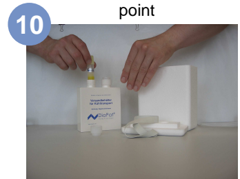
Notify pick-up service after 24 hours and place monovette into cooling element immediately before shipment