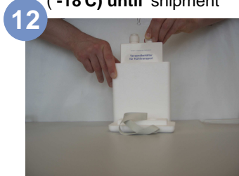
Insert cooling element into styrofoam box and save cover with elastic band