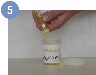
Soak up urine into monovette, make sure to pull out piston completely