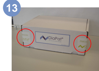
Insert sample and documents into packet and seal it with the badges