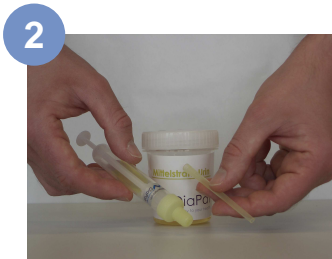
Have urine monovette and canula ready