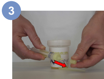
Pull off sealing cap