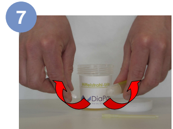
Break piston at predetermined breaking point