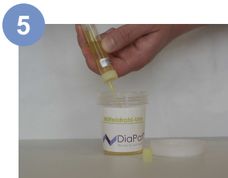
Soak up urine into monovette, make sure to pull out piston completely