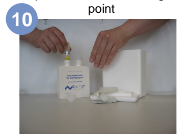
Notify pick-up service after 24 hours and place monovette into cooling element immediately before shipment