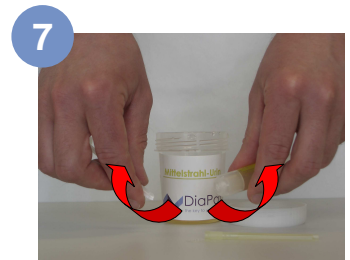
Break piston at predetermined breaking point