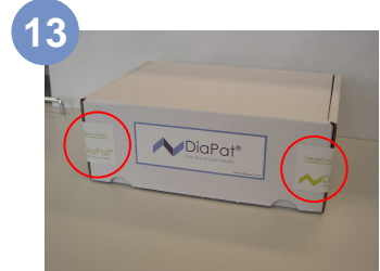
Insert sample and documents into packet and seal it with the badges