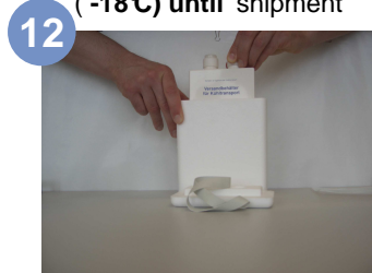
Insert cooling element into styrofoam box and save cover with elastic band