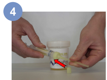
Place canula on urine monovette